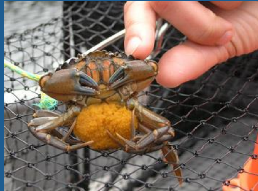
European Green Crab: An Invasive Species Moving North Towards Alaska