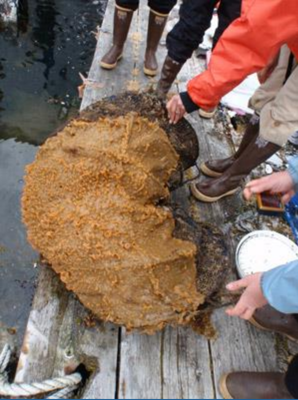
Didemnum vexillum, colonial tunicate discovered in Sitka and infesting a large area of the Georges Banks fishing grounds