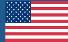
United States of America