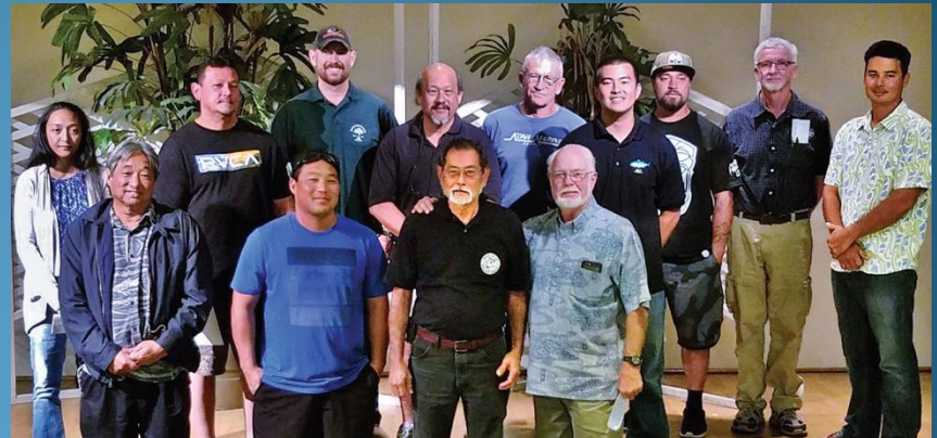
Hawaii Advisory Sub-Panel