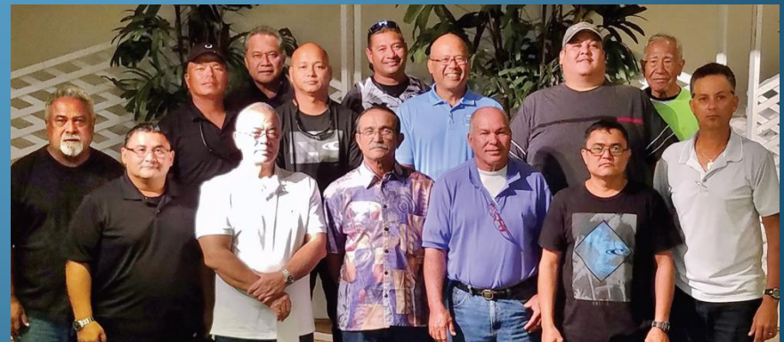
CNMI Advisory Sub-Panel