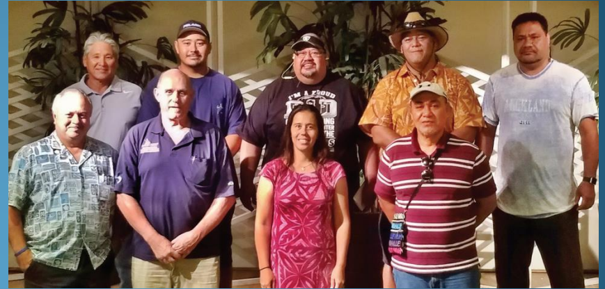
American Samoa Advisory Sub-Panel