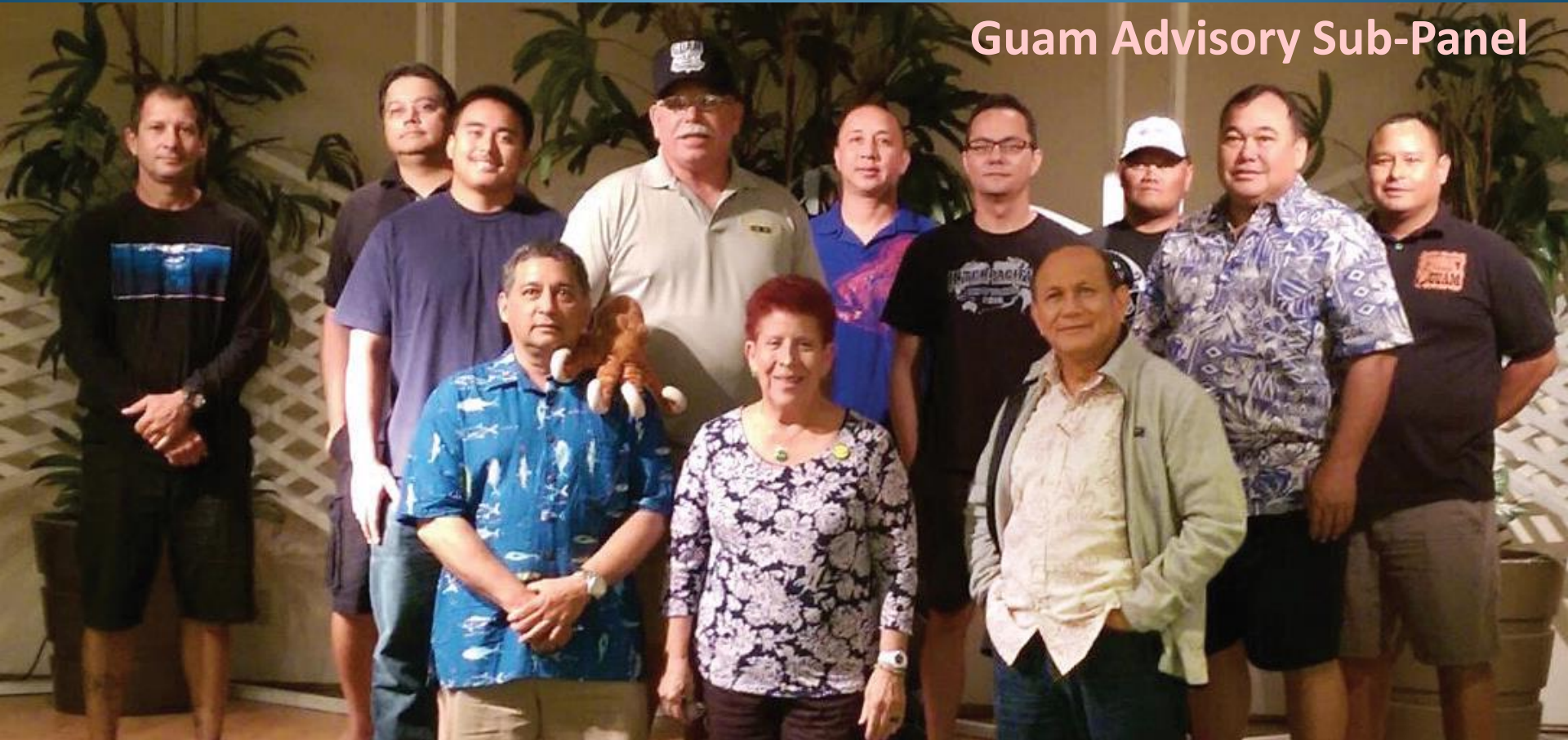
Guam Advisory Sub-Panel

Western Pacific Fishery Management Council